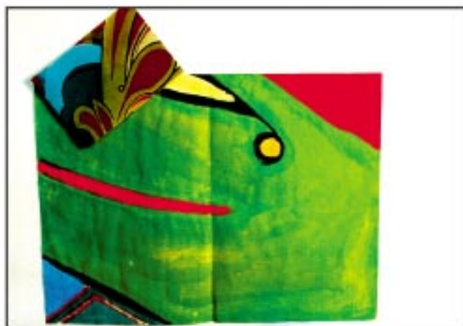
Session 6 Example of drawing with a brush.