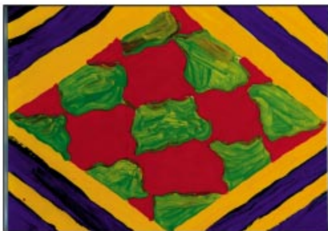
Session 5 Example of exploring colour groups and contrasts.