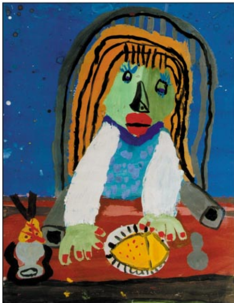
Session 4 Example of working in the style of another artist. (Picasso).